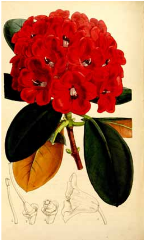
R. fulgens Walter Hood Fitch

Rhododendron fulgens has a wide distribution throughout the Himalayas, ranging through Nepal, Sikkim, Bhutan, Assam, and south Tibet. Discovered by J.D. Hooker in 1849, in Sikkim, R. fulgens grows on mountain slopes, in thick rhododendron and Abies forests, and on open hillsides at elevations of 10,000-14,000 feet. It forms impenetrable thickets of itself between 12,000 and 14,000 feet and grows from five to fifteen feet tall. R. fulgens has striking crimson bracts on its new growth, roundish, shiny, dark-green leaves (often glaucous blue-green when young, similar to R. campanulatum ) with a thick, brown, unistrate indumentum. Also, it has smooth and peeling red-