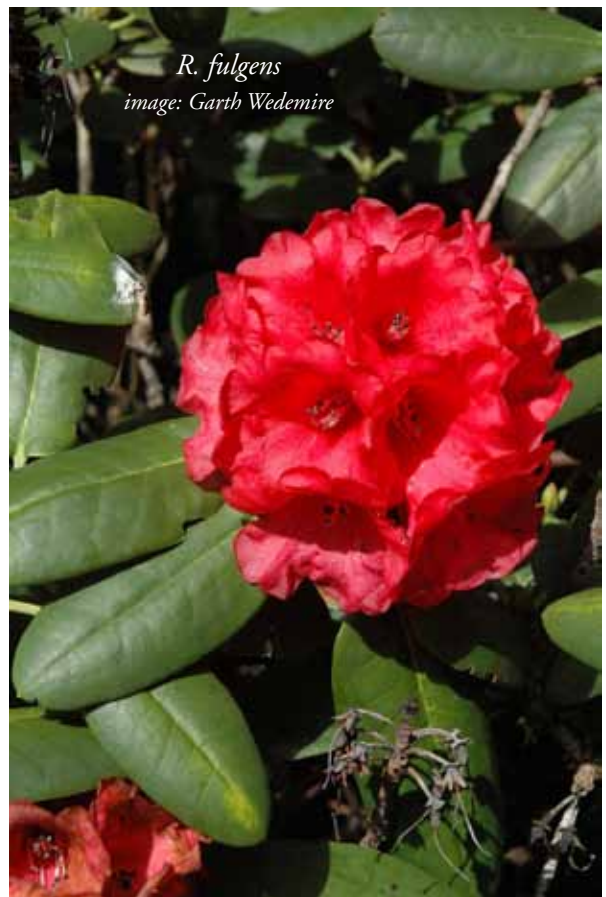
R. fulgens