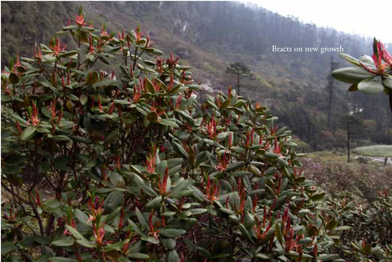
Bracts on new growth