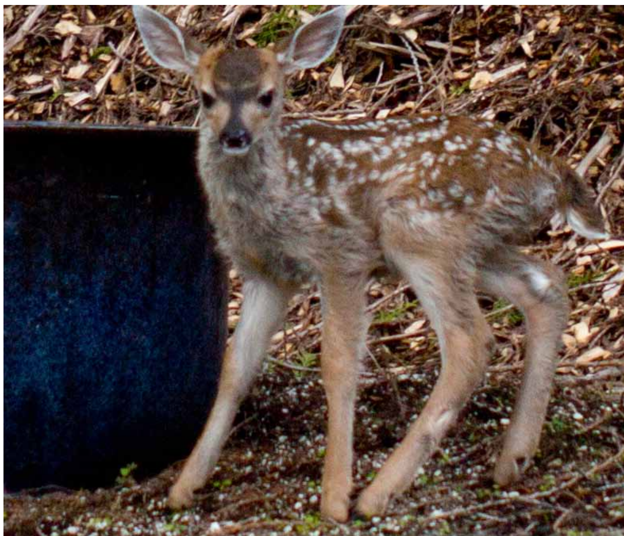
Only days old, and already an accomplished pruner in the garden

Please follow this link to the most incredible Rhododendron tour ever undertaken