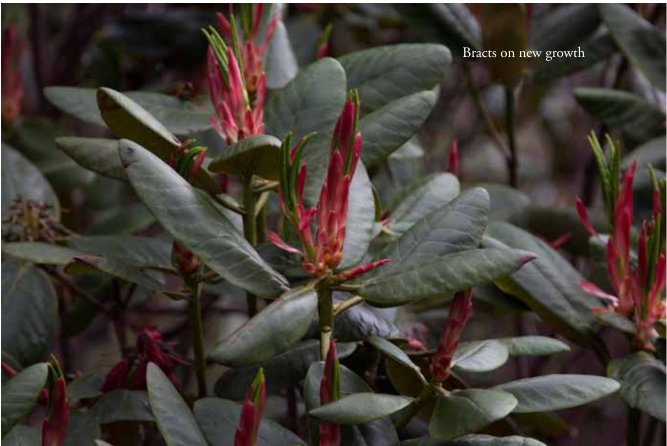
Bracts on new growth