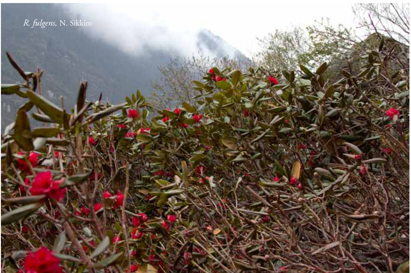
R. fulgens , N. Sikkim