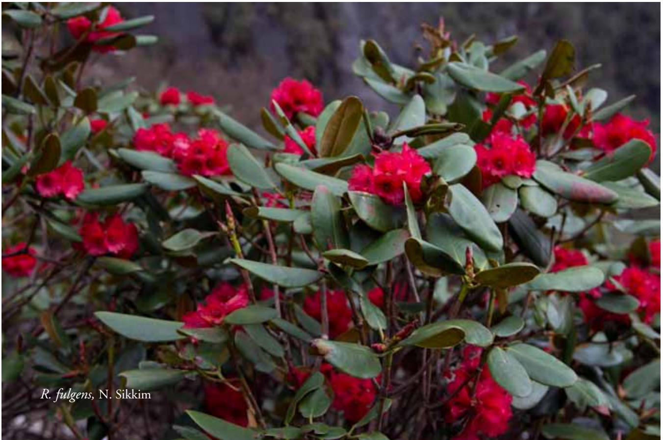
R. fulgens , N. Sikkim