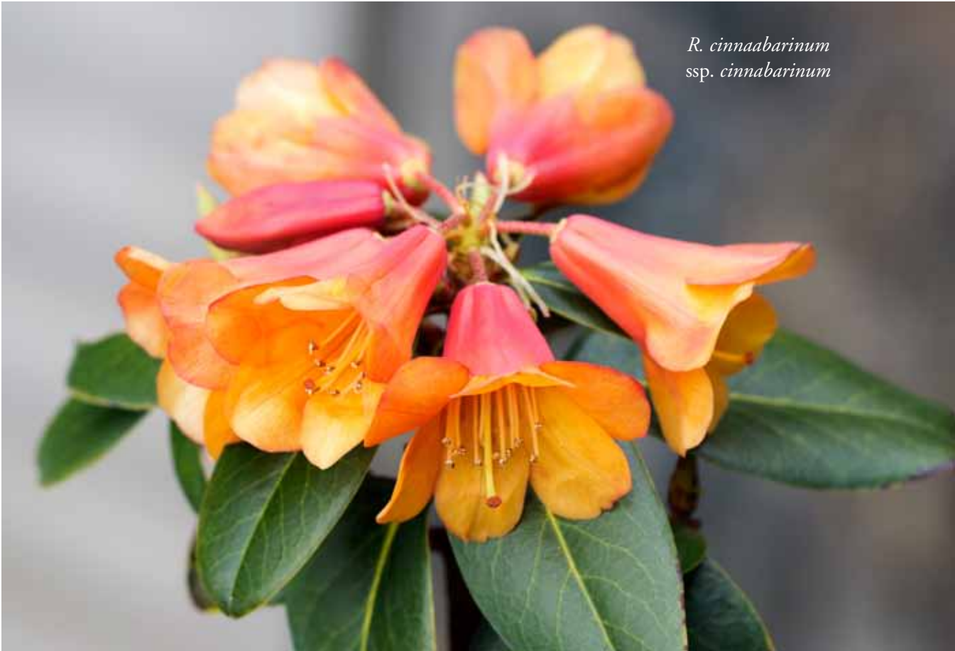
R. cinnaabarinum ssp. cinnabarinum