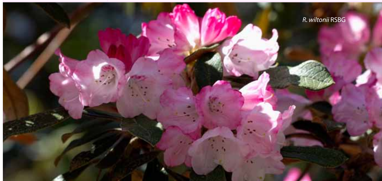
R. wiltonii RSBG