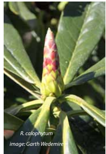
R. calophytum

But enough daydreaming, it's time for business: First, our January 21 regular meeting is reserved for elections, desserts and slide presentations. Please bring your favourite dessert and garden or nature photos, or better still, e-mail them to me (the photos, not the desserts) so I can set them up beforehand. Your presidents' contribution will be a brief show on magnificent Araucaria in the wilds of southern Chile and elsewhere.