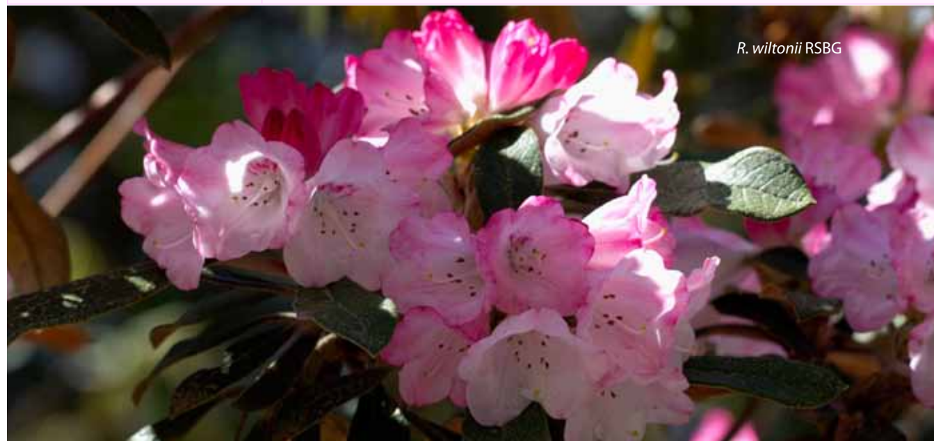
R. wiltonii RSBG