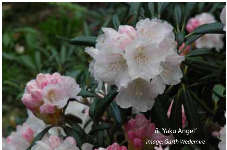
R. 'Yaku Angel'

Erratum: In my last column I referred to R. 'Yaku Princess' as one of our favourite rhodos. Silly me. I meant to say R. 'Yaku Angel' . In my view it's far superior in both form and flower to R. 'Yaku Princess'