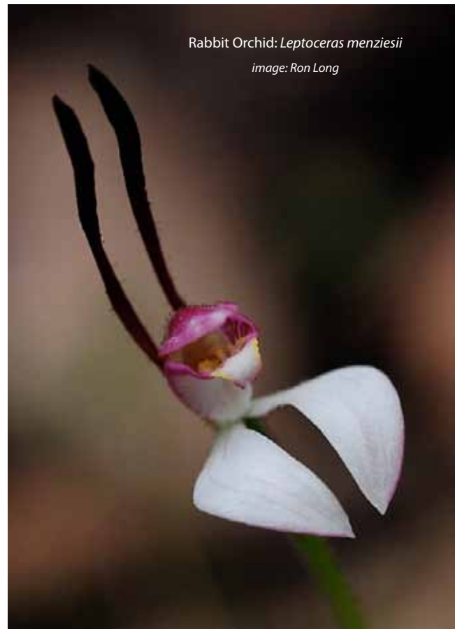
Rabbit Orchid: Leptoceras menziesii