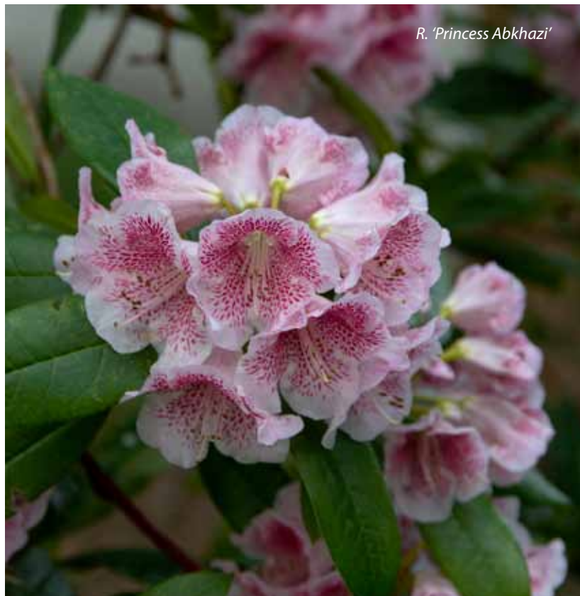
R. 'Princess Abkhazi'