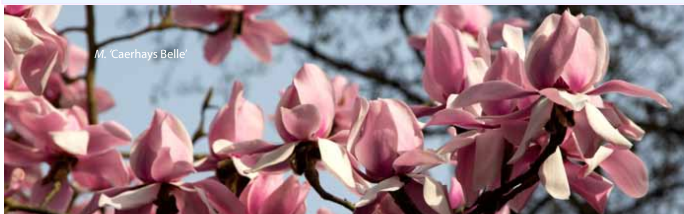
M. 'Caerhays Belle'